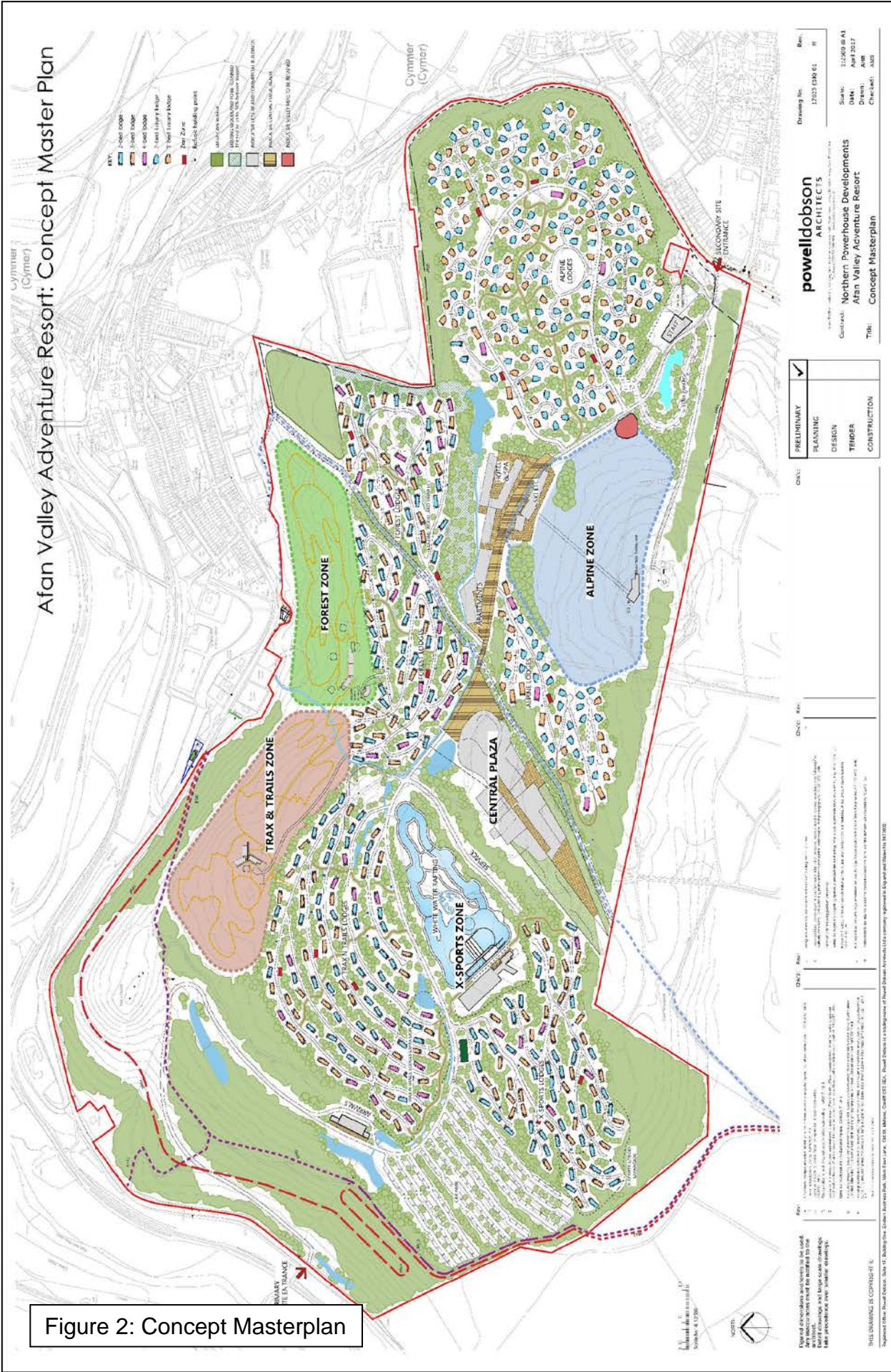
Figure 2: Concept Masterplan